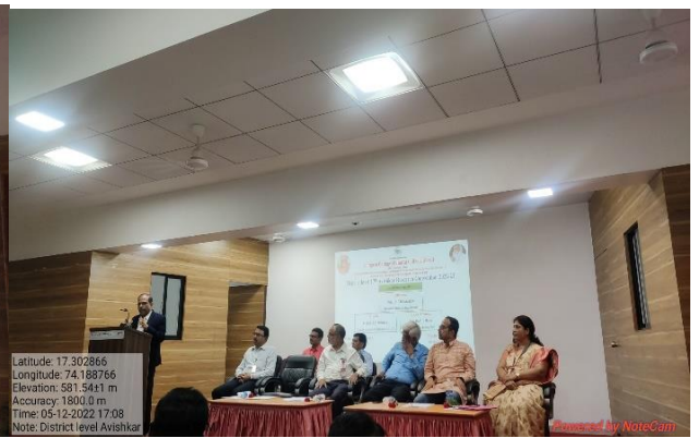
Latitude: 17.302866 Longitude: 74.188766 Elevation: 581.5441 m Accuracy: 1800.0 m Time: 05-12-2022 17:08 Note: District level Avishkar Mahotsav SGM