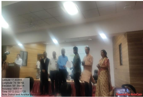
Latitude: 17.302866 Longitude: 74.188766 Elevation: 581.5441 m Accuracy: 1800.0 m Time: 05-12-2022 17:20 Note: District level Avishkar Mahotsav SGM