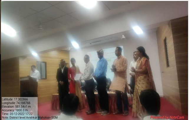
Latitude: 17.302866 Longitude: 74.188766 Elevation: 581.5441 m Accuracy: 1800.0 m Time: 05-12-2022 17:22 Note: District level Avishkar Mahotsav SGM