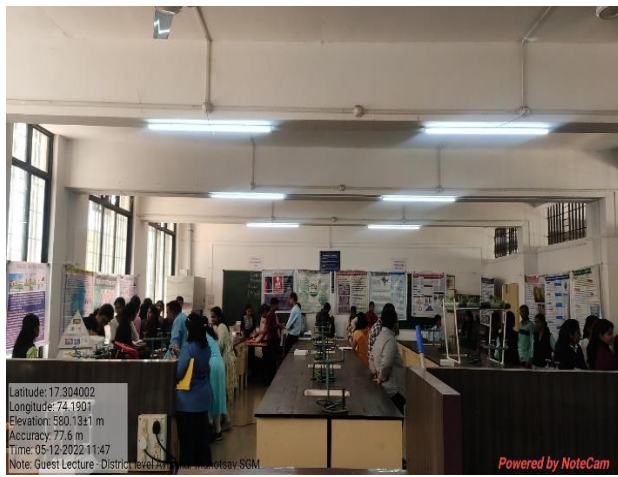
Latitude: 17.304002 Longitude: 74.1991 Elevation: 580.1341 m Accuracy: 77.6 m Time: 05-12-2022 11:47 Note: Guest Lecture - District level Avishkar Mahotsav SGM